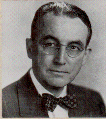
Arthur J. Altmeyer Member 1935-1937 Chairman 1937-1946