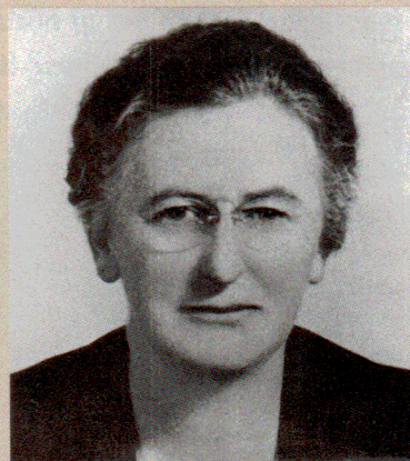
Mary W. Dewson Member 1937-1938