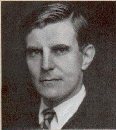
John G. Winant Board Chairman 1935-1937

From 1935 until 1946, the Social Security program was the responsibility of a three-person executive board known as the Social Security Board. During this 11-year period, six different individuals were members of the Social Security Board.